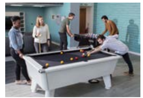
*Not all room options may be available.

The majority of student accommodation in Plymouth is within short walking distance of the campus, and in the city centre, making for convenient living, and with little or no daily travel expense to worry about. www.plymouth.ac.uk/ accommodation