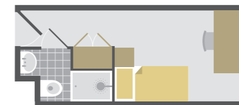
Example room layout

Just a short walk from the INTO Centre and close to The University of Manchester, your accommodation has a central location which means you'll be close to many restaurants, cafés and shops.