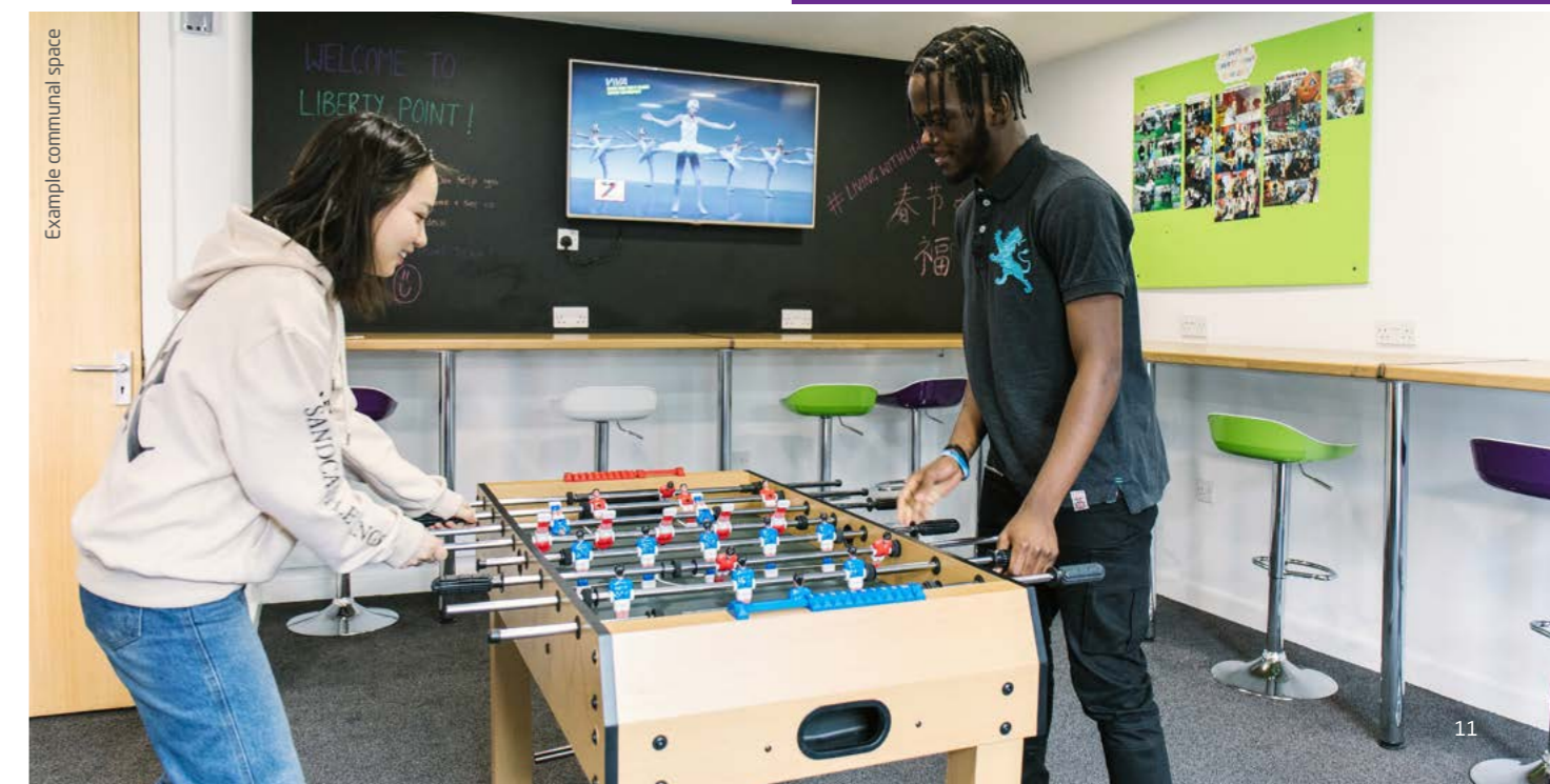
Example communal space