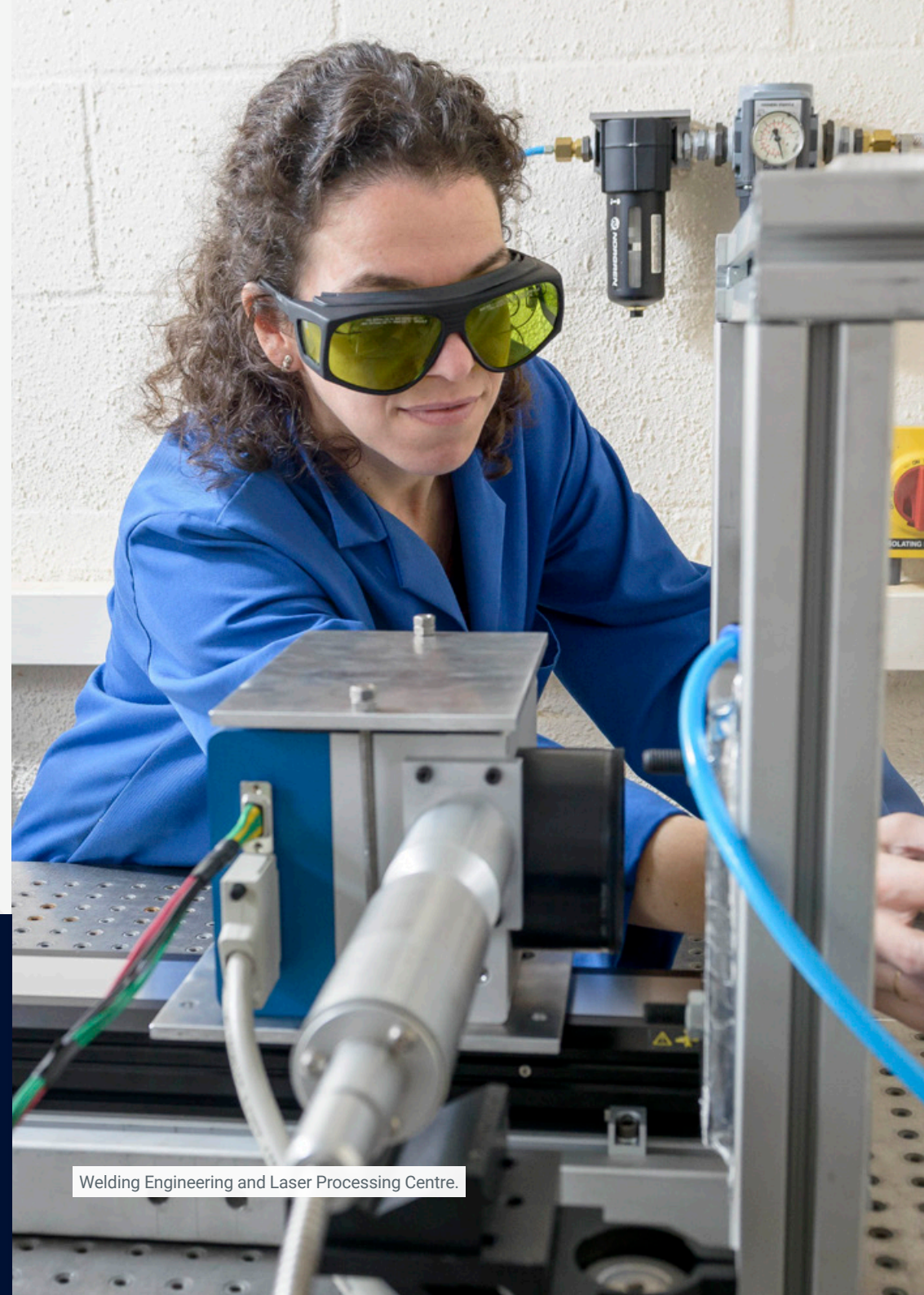
Welding Engineering and Laser Processing Centre.