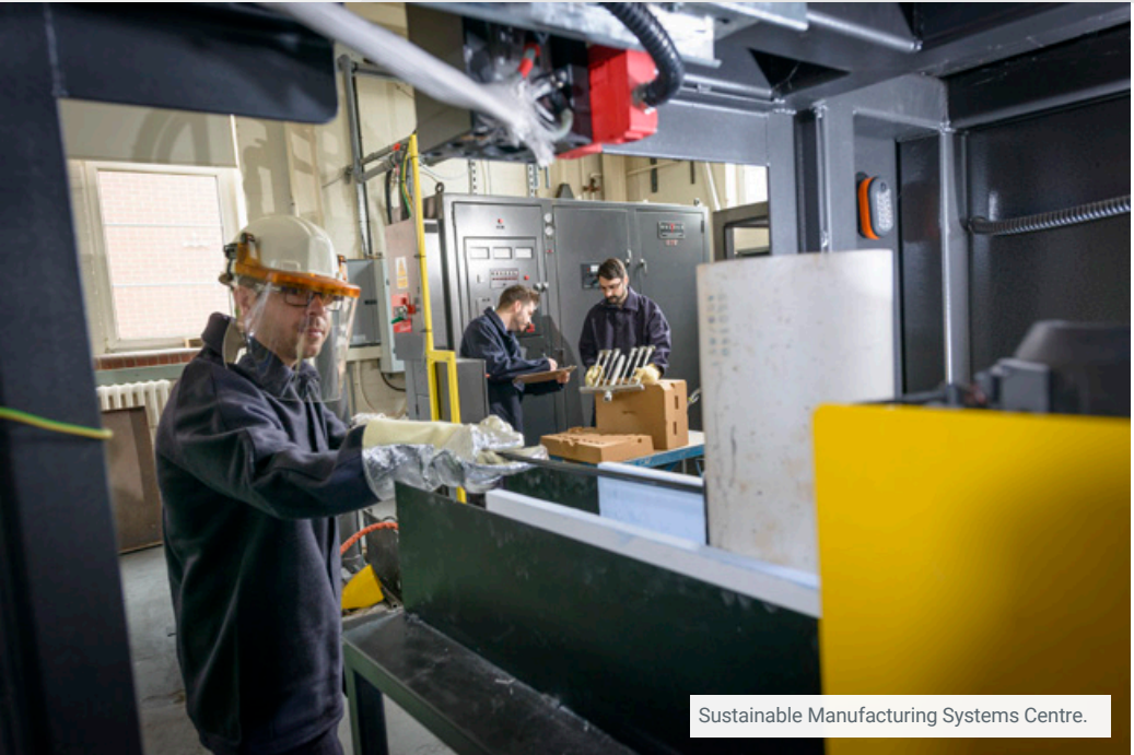
Sustainable Manufacturing Systems Centre.